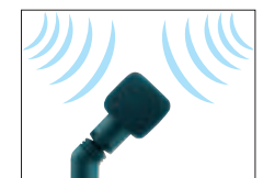
Attachable Stereo Microphone ME 50S